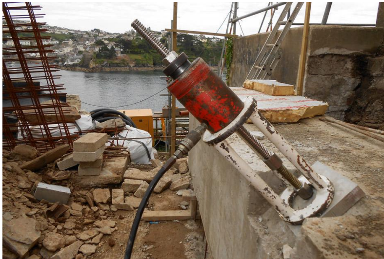
Mechanical components for Anchor Threadbar pull out test